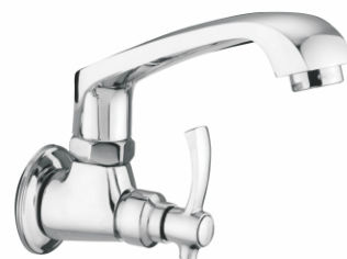
8039 - Sink Cock 'U' Bend Rev.