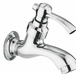
8003 - Bib Cock .