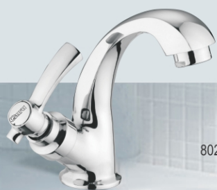
8024 - Swan Neck with Fixed Spout