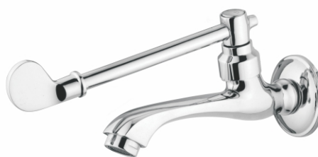
8008 - Long Body Elbow Action