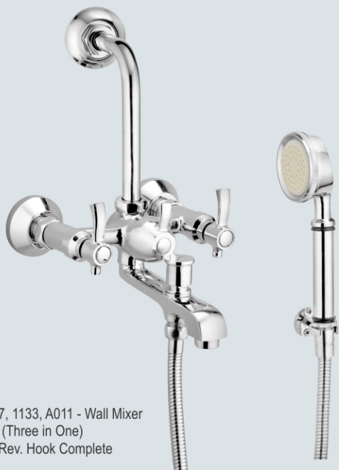
8031, 2047, 1133, A011 - Wall Mixer (Three in One) with Rev. Hook Complete