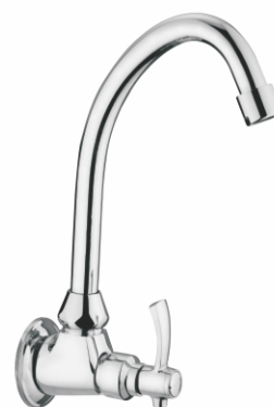
8037 - Sink Cock 'J' Pipe Rev.