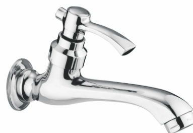
8006 - Long Body