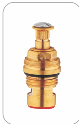
A095 - Spindle Small