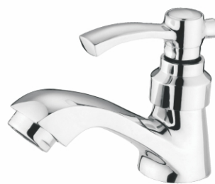
8001 - Pillar Cock