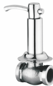
8016 - Concealed Stop Cock 20mm