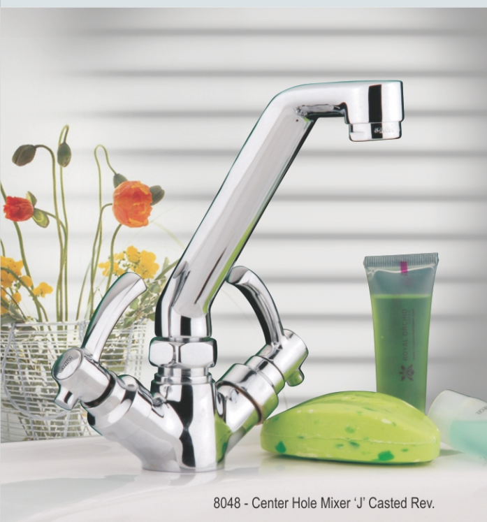
8048 - Center Hole Mixer 'J' Casted Rev.