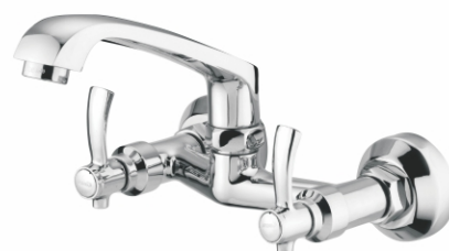
8040 - Sink Mixer 'C' Bend Rev.