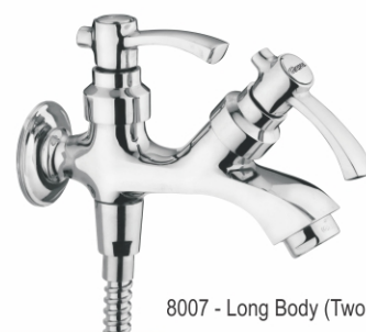
8007 - Long Body (Two in One)