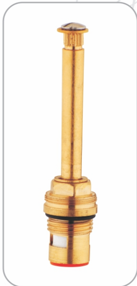
A096 - Spindle Concealed