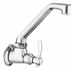
8038 - Sink Cock 'J' Casted Rev.