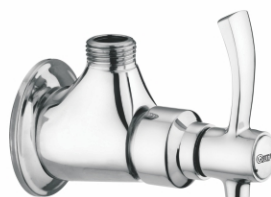
8020 - Angle Cock