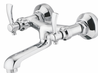
8032 - Wall Mixer Non Telephonic