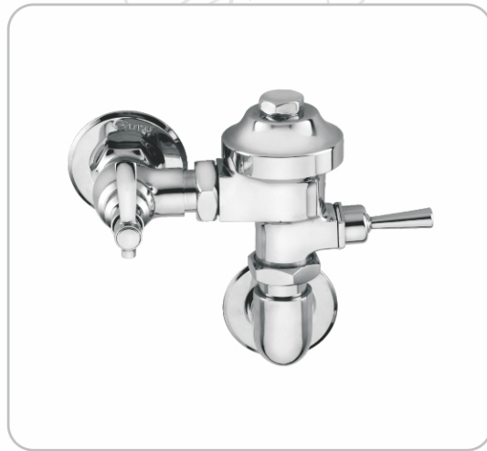
8050 - Flush Valve G-II with Elbow