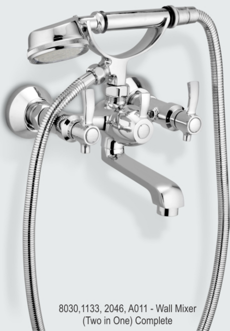
8030, 1133, 2046, A011 - Wall Mixer (Two in One) Complete