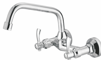
8042 - Sink Mixer 'C' Pipe Rev.