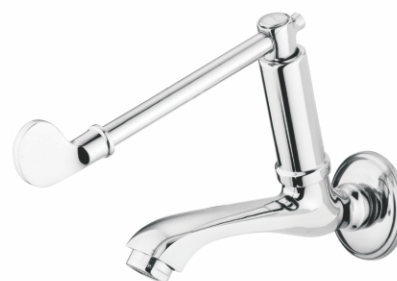
8009 - Long Body Elbow Action Long Neck