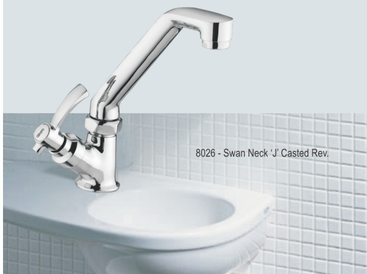
8026 - Swan Neck 'J' Casted Rev.