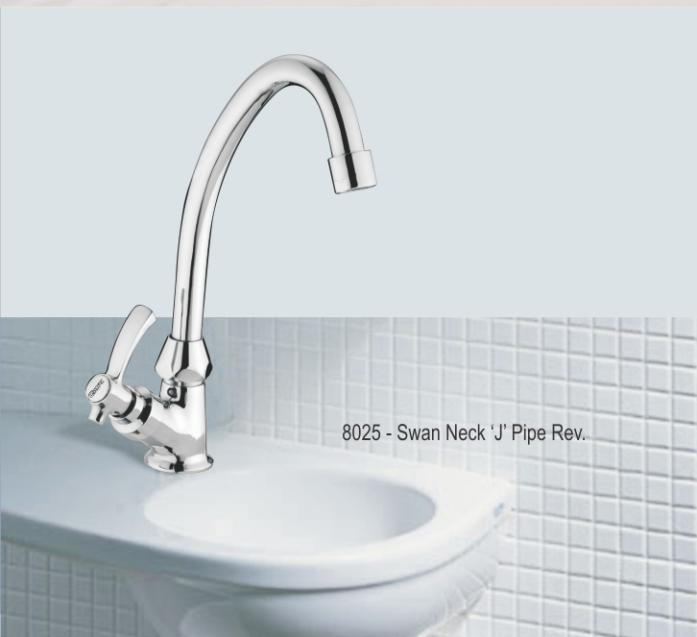
8025 - Swan Neck 'J' Pipe Rev.