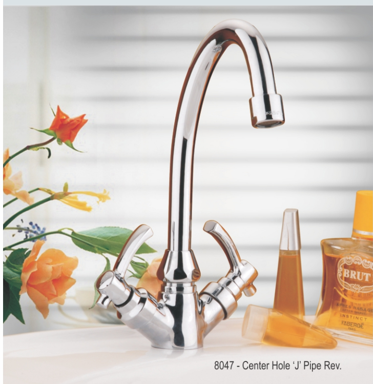
8047 - Center Hole 'J' Pipe Rev.