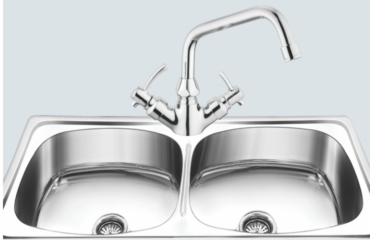
8043 - Sink Mixer Table Top Rev.